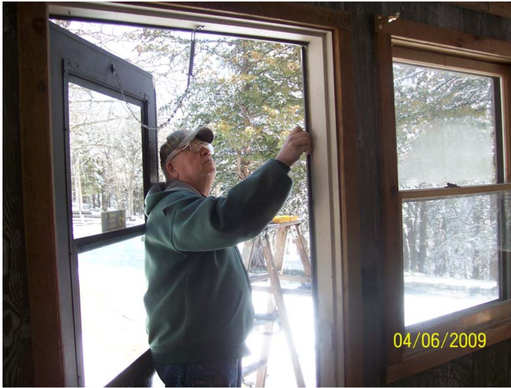
Fixing the door molding to prevent drafts...and mice!