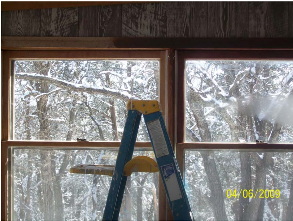
Staining the trim. Before (l) and after (r)