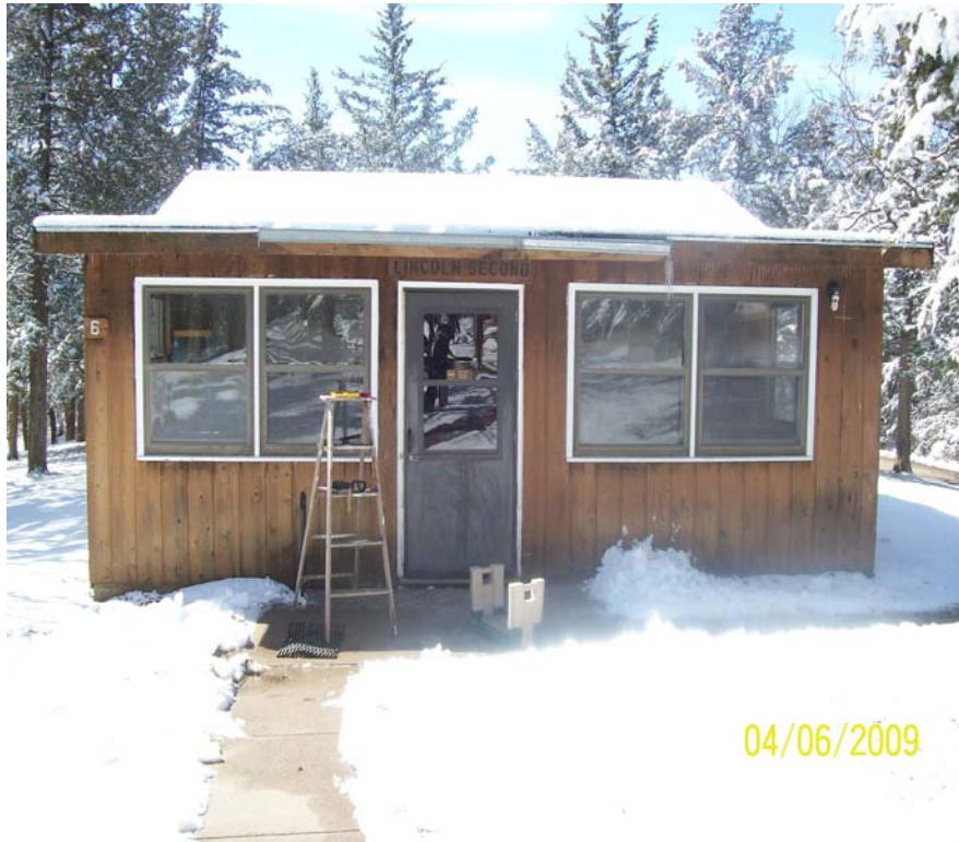
Cabin #6 at Camp Moses Merrill