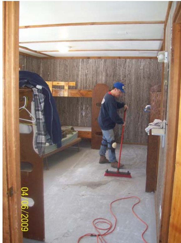
Sweeping the floor after sanding the old paint.